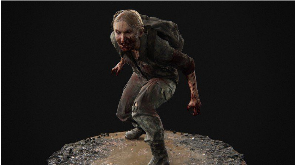
Female Runner: tloup2_female_runner.mp3 Male Runner: tloup2_male_runner.mp3