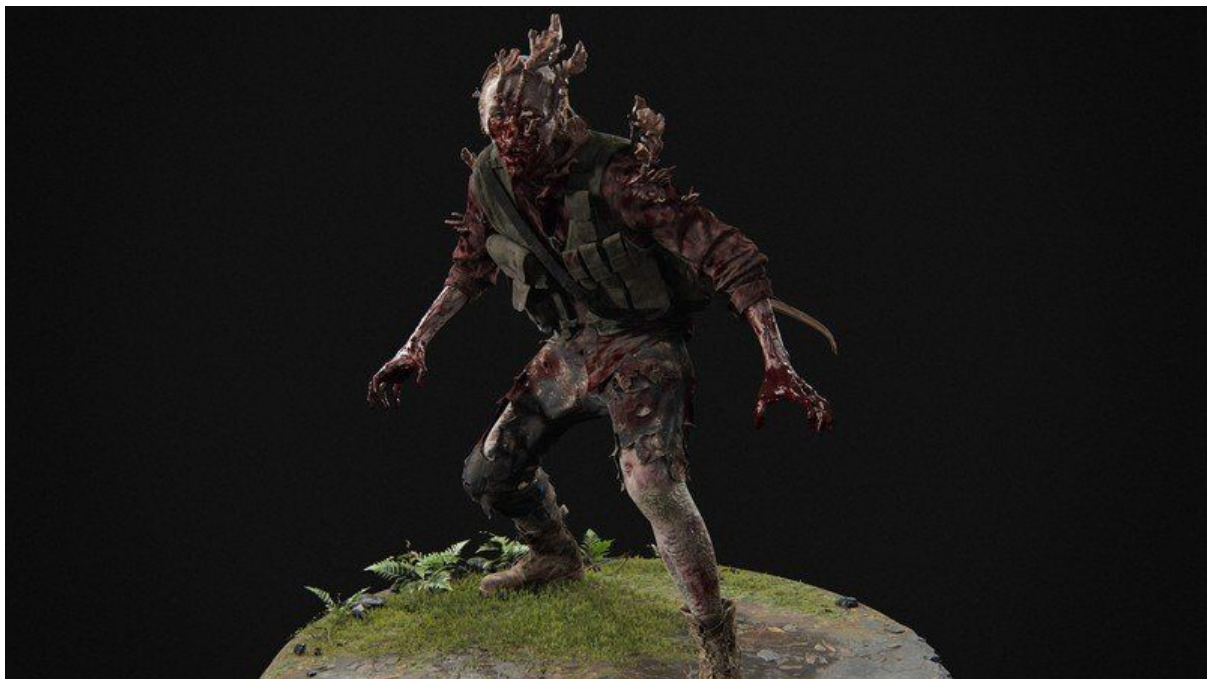
Female Stalker: tloup2_female_stalker.mp3 Male Stalker: tloup2_male_stalker.mp3

A more advanced stage, still a bit human sounding. The difference between female and male stalkers is less audible.