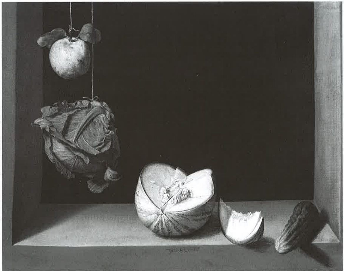
FIGURE 1.3 Juan Cotán, Quince, Cabbage, Melon and Cucumber , c. 1602.

Look at the painting of a still life by the Spanish painter, Juan Sanchez Cotán (1521–1627), entitled Quince, Cabbage, Melon and Cucumber (Figure 1.3). It seems as if the painter has made every effort to use the ‘language of painting’ accurately to reflect these four objects, to capture or ‘imitate nature’. Is this, then, an example of a reflective or mimetic form of representation – a painting reflecting the ‘true meaning’ of what already exists in Cotán’s kitchen? Or can we find the operation of certain codes,